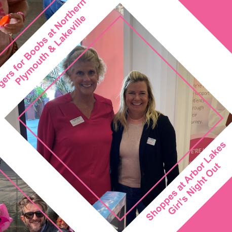
Shoppes at Arbor Lakes Girl's Night Out