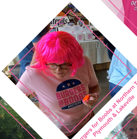
Burgers for Boobs at Northern Tap Plymouth & Lakeville