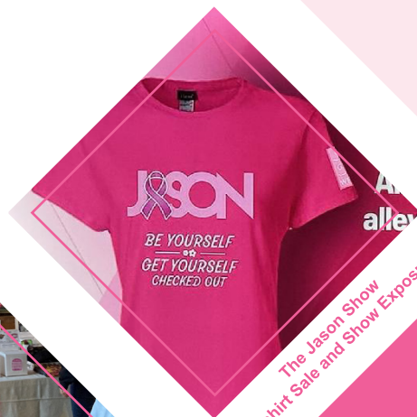
The Jason Show T-shirt Sale and Show Exposure

Request a kit that includes Hope Chest brochures, promotional materials, social media templates, modifiable posters, event ideas, and more! Contact Robin Chambers at rchambers@hopechest.com to receive a kit.