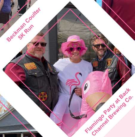
Flamingo Party at Back Channel Brewing Co.