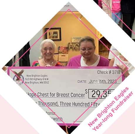
New Brighton Eagles Year-long Fundraiser