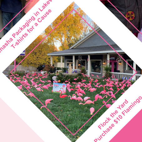
Flock the Yard Purchase $10 Flamingo