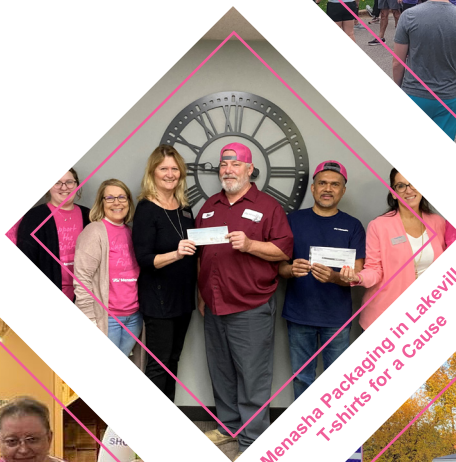
Menasha Packaging in Lakeville: T-shirts for a Cause