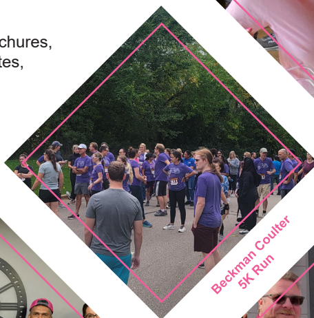
Beckman Coulter 5K Run